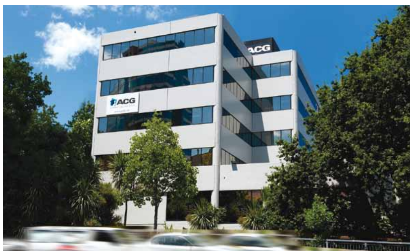
ACG City Campus.